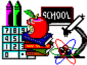
Education & Kids