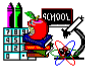
Education & Kids