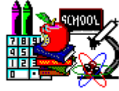
Education & Kids