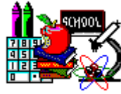
Education & Kids